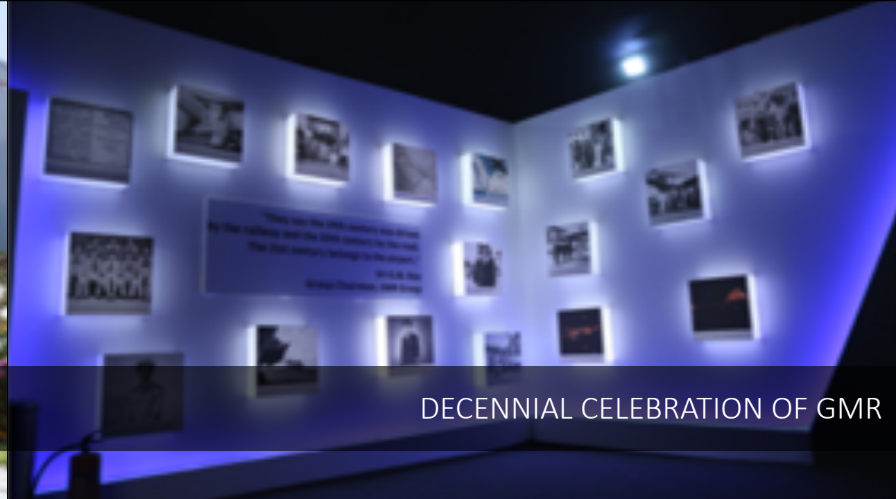
DECENNIAL CELEBRATION OF GMR