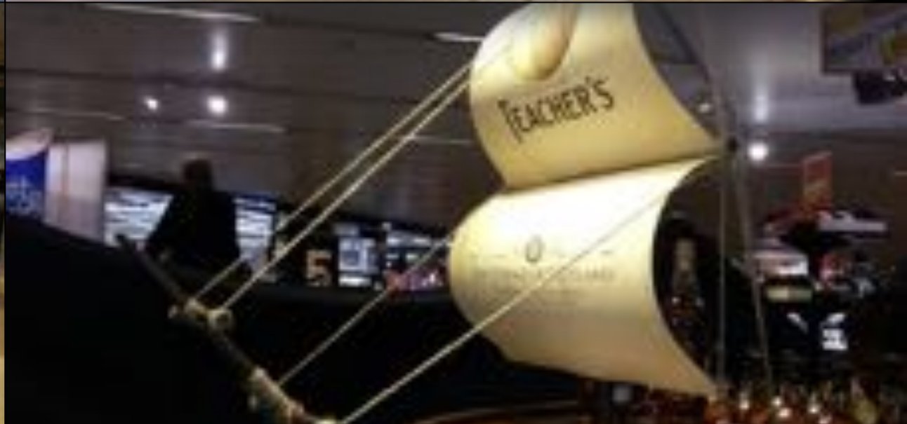
Destination: IGI Airport, New Delhi Category: Activation