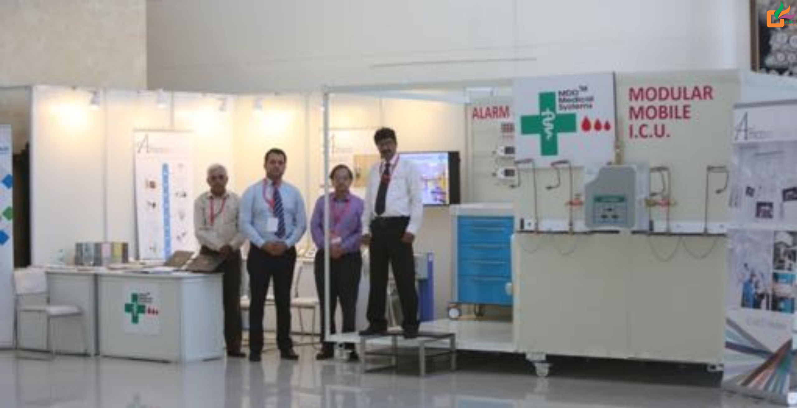
Destination: Manekshaw Convention Centre, New Delhi Category: Exhibition MEDICAL EQUIPEMENT EXHIBITION