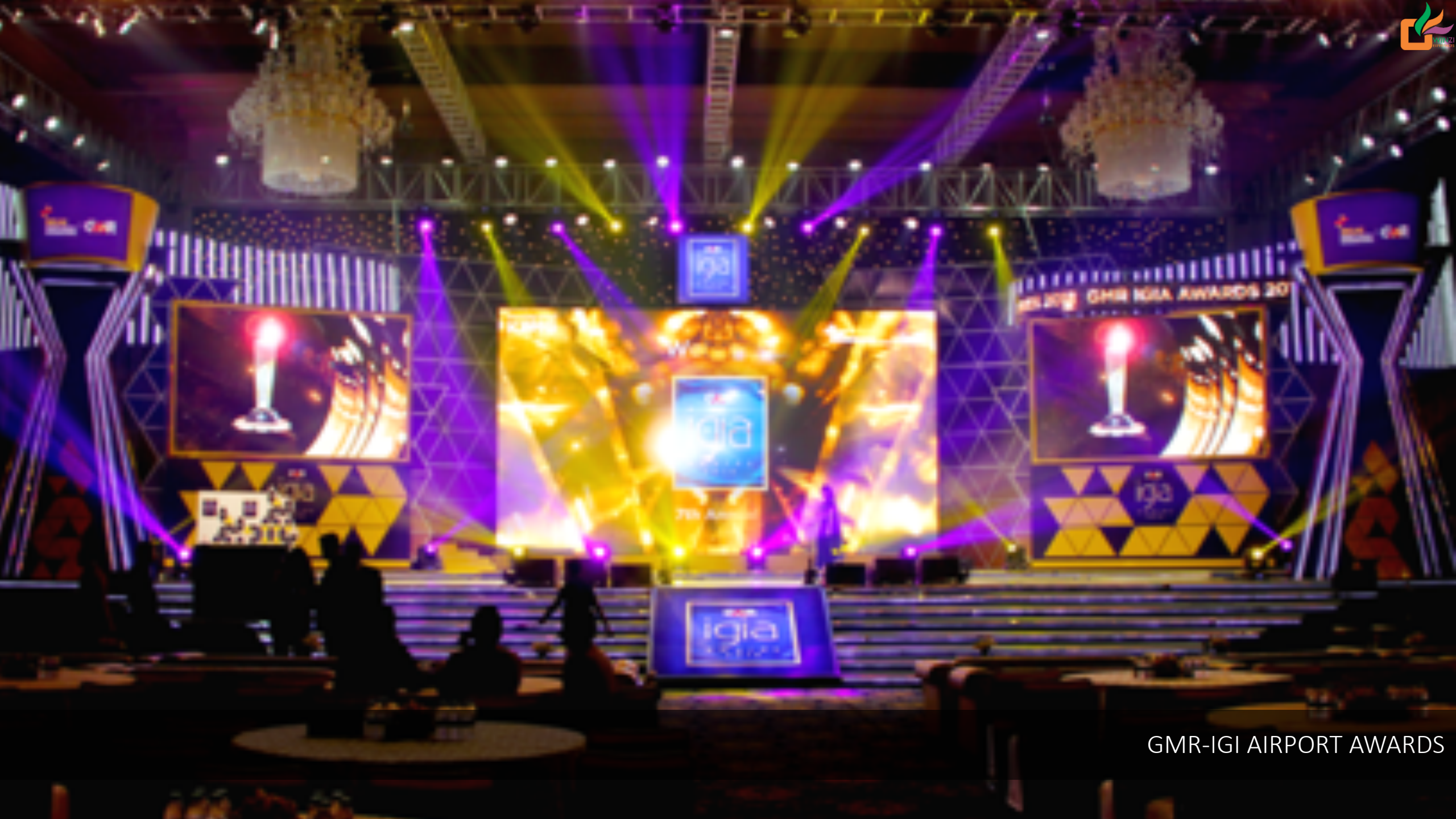
GMR-IGI AIRPORT AWARDS