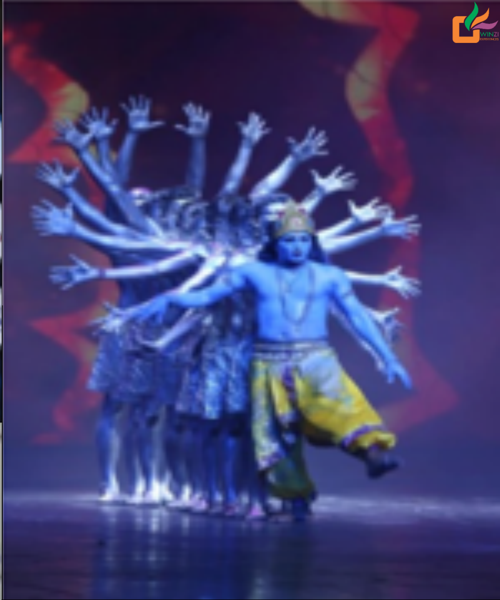
GMR-IGI AIRPORT AWARDS