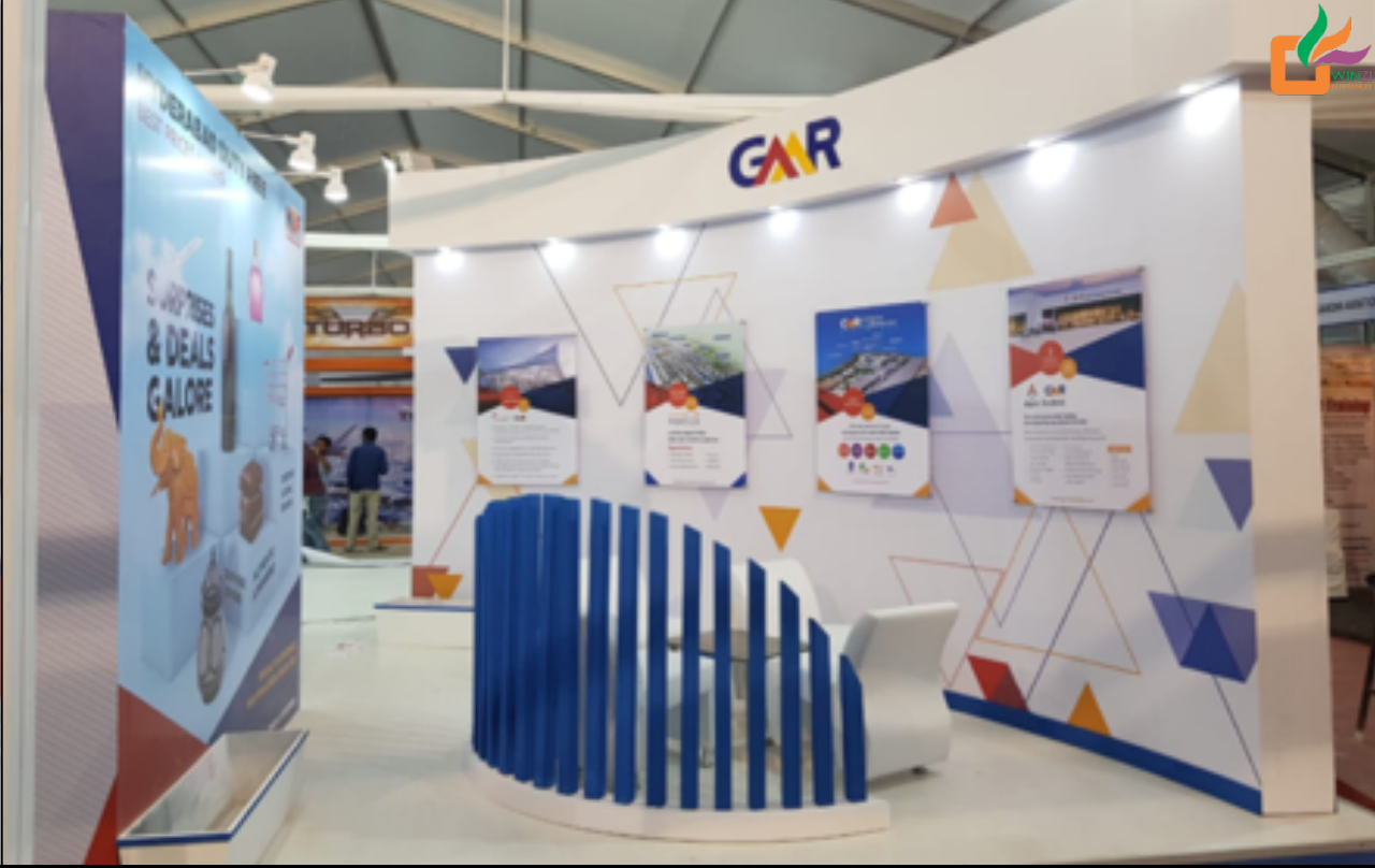
GMR Booth at Wings India International Exhibition and Conference on Civil Aviation