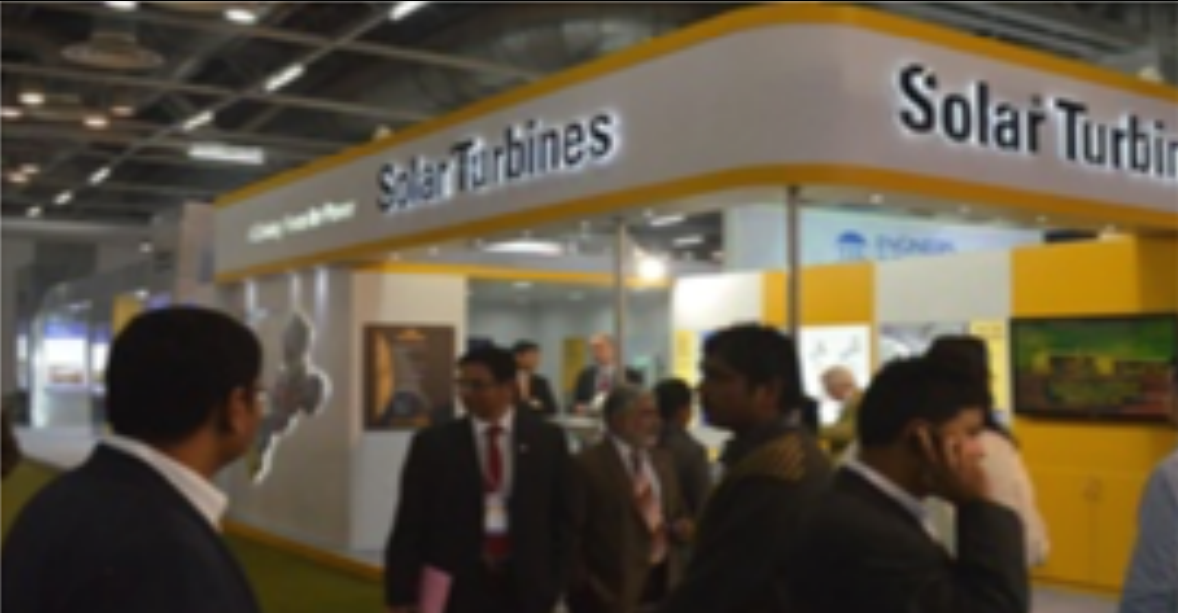
SOLAR TURBINES @ PETROTECH