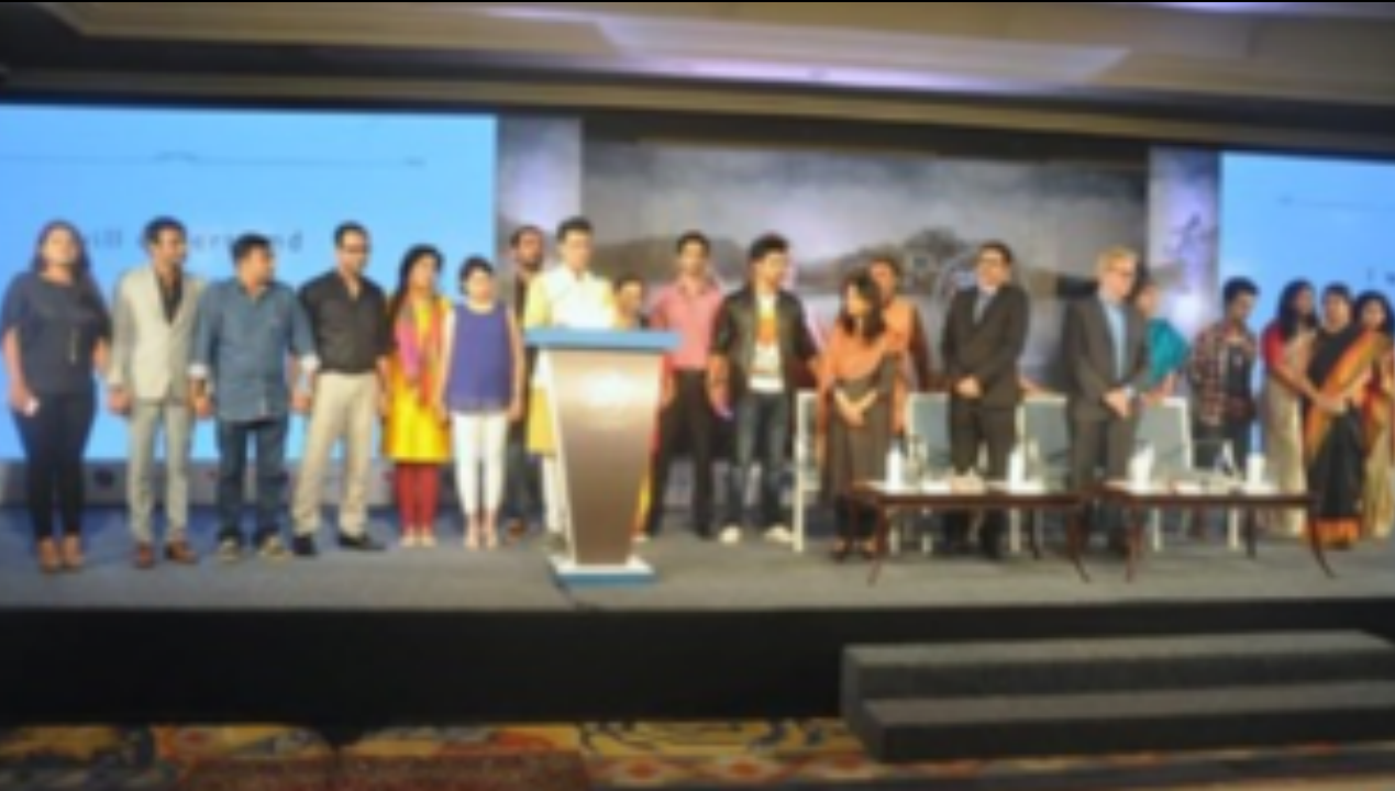
UNICEF India in partnership with BBC Media Action Launch OF 'AdhaFULL' TV series focusing on gender equality and empowerment