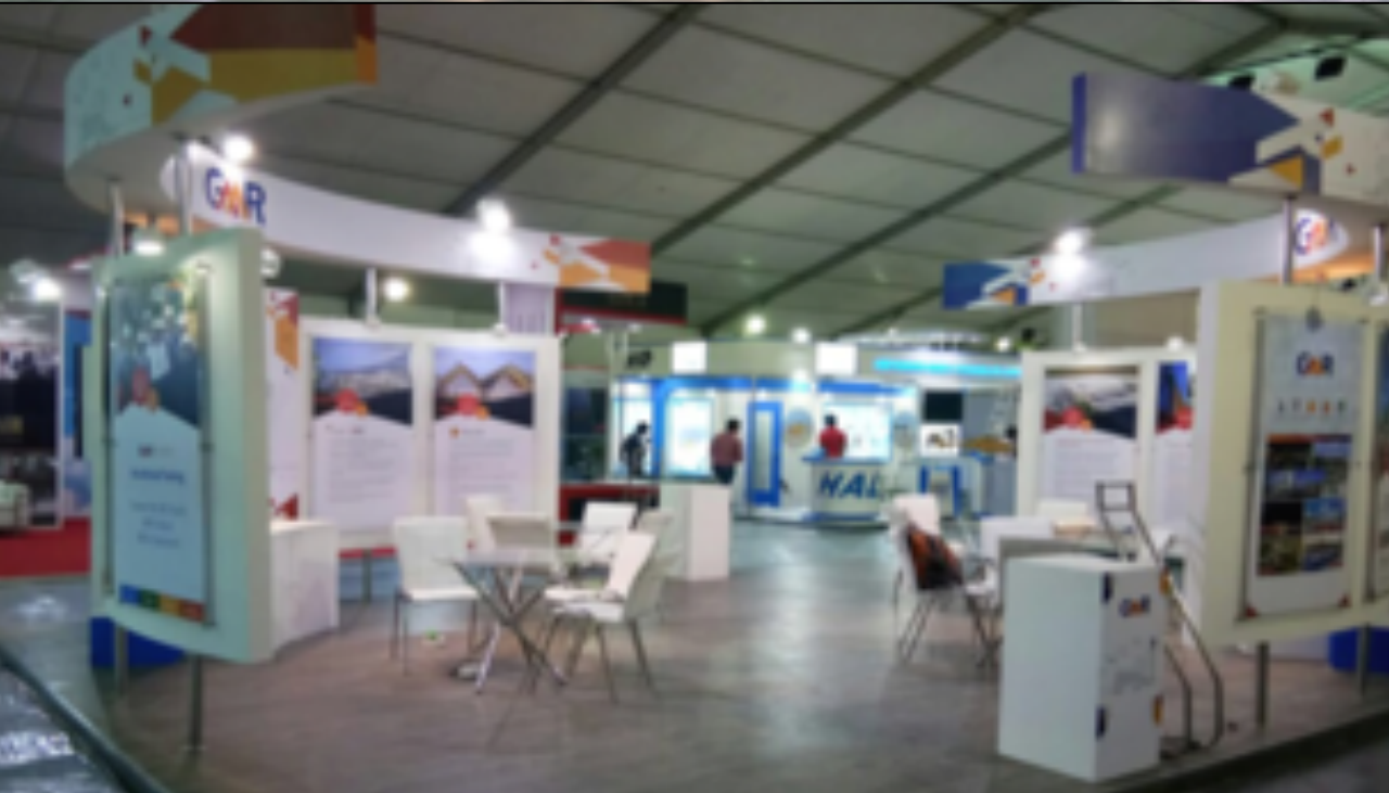
GMR AERO SHOW