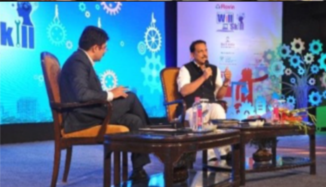
Zee – Will To Skill Program Launch