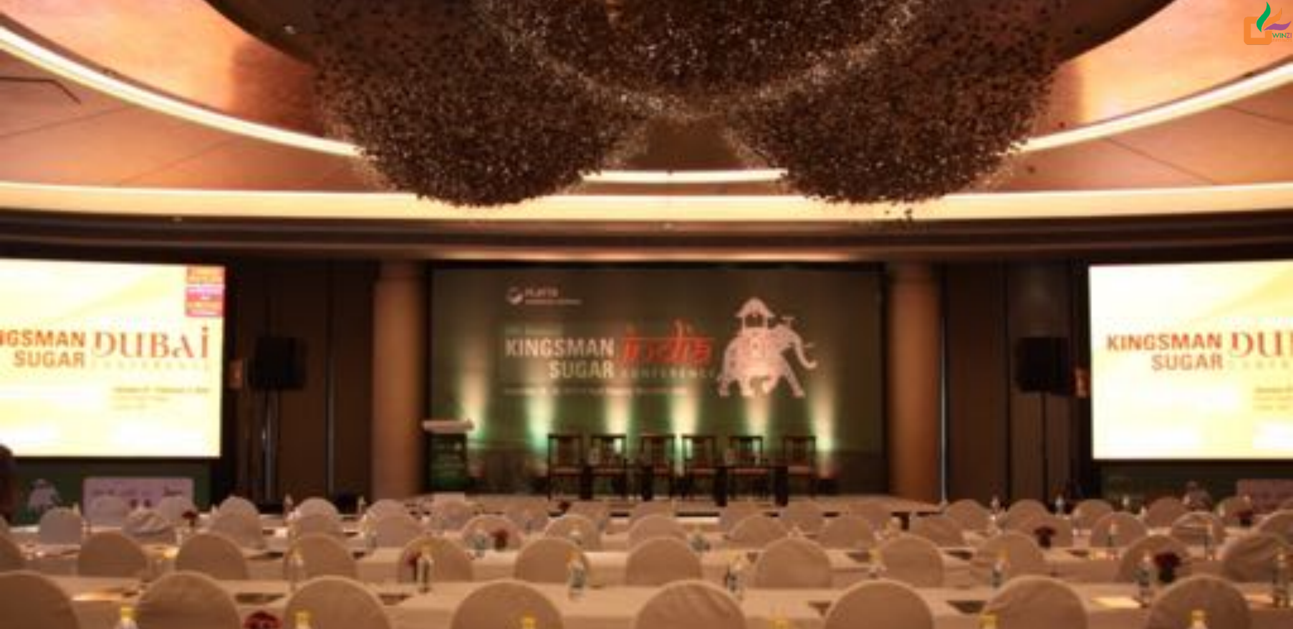
No. Of Delegates: 180 Destination: Delhi Category: Conference & PR KINGSMAN ASIA SUGAR CONFERENCE – NEW DELHI