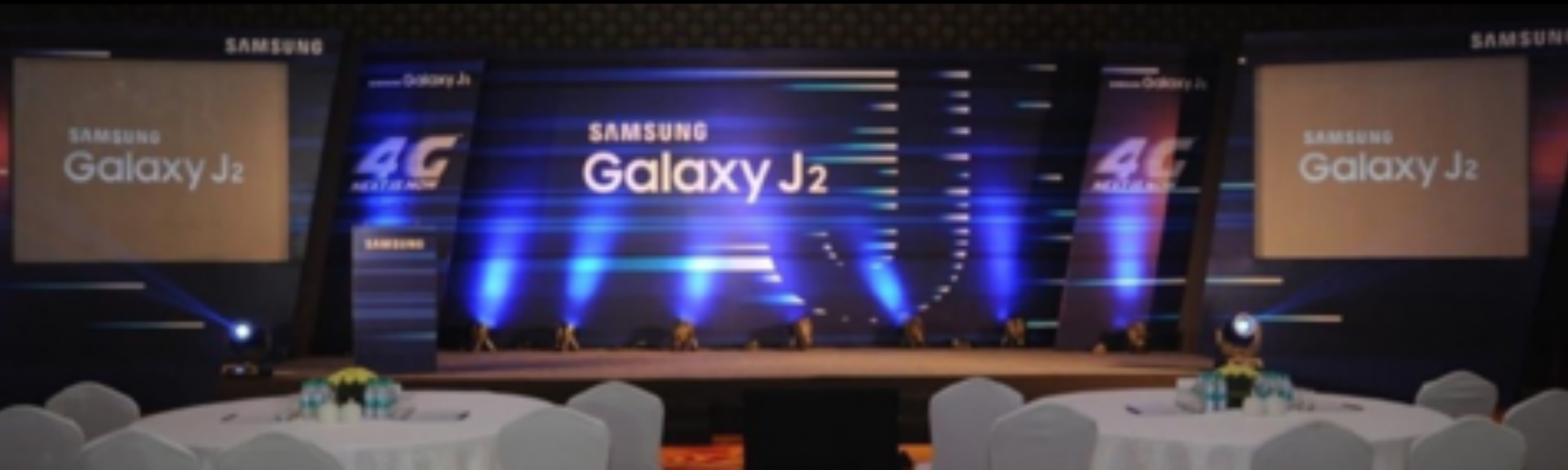
Samsung GALAXY J2 Launch EVENT & Multi City ACTIVATION